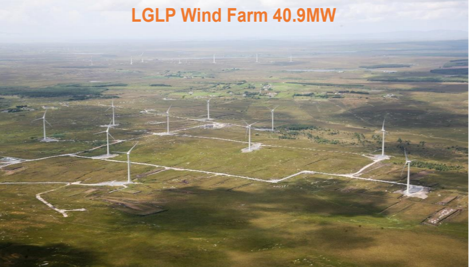
LGLP Wind Farm 40.9MW

Ireland imported 67% of its energy requirement in 2018, one of the highest ratios in Europe. The more of its own energy Ireland can produce, the less vulnerable it would be to foreign policy and conflict interrupting gas, oil, and electricity supply lines. There is an opportunity to continue developing a strong indigenous wind industry, that will take advantage of Ireland's excellent wind resource, reducing our import dependency.