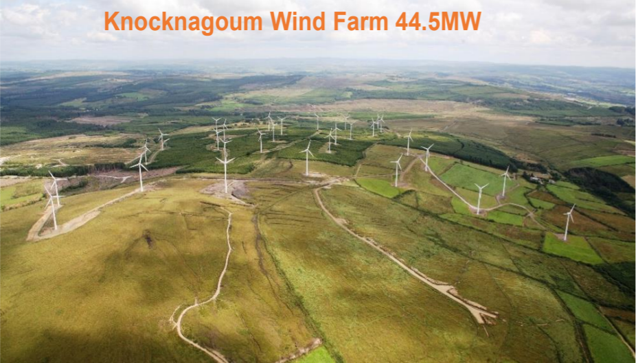
Knocknagoum Wind Farm 44.5MW